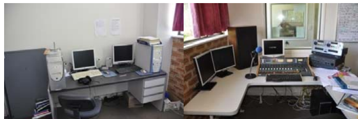
Above, left: the post-production area, right: the 'new' production desk

106five's 'new' production studio is taking shape and wiring is now almost complete. The studio will take significant pressure off the overworked main production studio and alleviate the necessity for voice-tracking to be done in the main on-air studio.