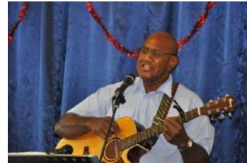
Entertainer and former League star Rex Egglese delights the crowd at the Christmas Party for 106five volunteers.