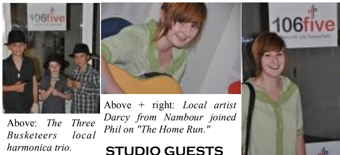
Above: The Three Basketeers local harmonica trio.